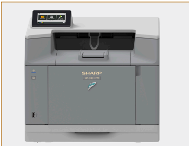
Standard desktop configuration shown.