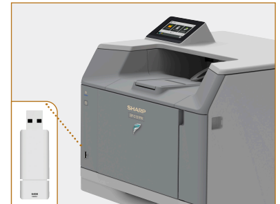
Front USB port for easy direct printing from memory devices.