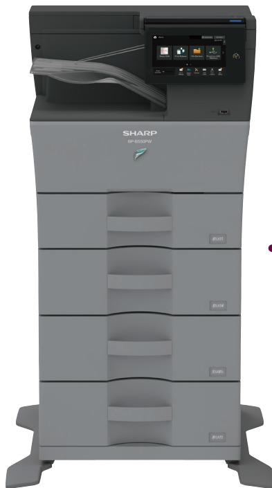
BPB550PW Monochrome Printer

Merging technology and functionality Versatile printers designed to elevate productivity.