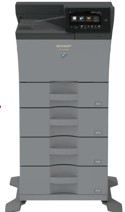
BPC545PW Colour Printer

Paper drawers feed up to 8.5" x 14" paper and support media up to 220 gsm (80 lb. cover). Supports up to 2,350 sheets in paper drawers and bypass tray with options.