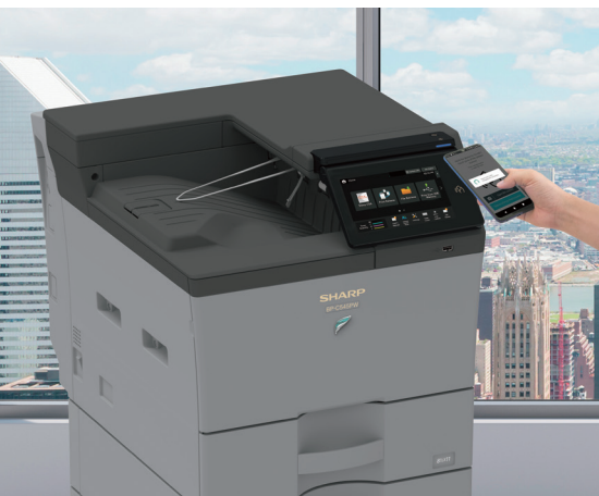
Seamless mobile connectivity for touchless operation. (BPC545PW shown)