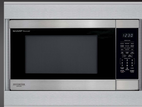
SMC2264KSC Microwave Oven with the SKM427F9HS Trim Kit

Includes Ducting, Finish Trim, and Easy-to-Follow Instructions