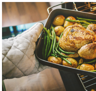
The included glide-rack allows for removing even the heaviest dishes