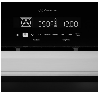
The glass touch control panel is easy to see and operate

With decades of experience designing innovative cooking appliances, it's easy to see why cooks around the world trust Sharp.