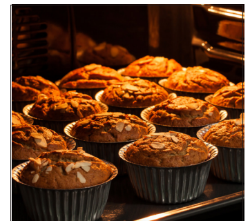
Keep an eye on your food from the outside with bright, halogen lighting