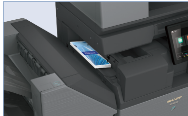
New Inner Folding Unit option offers a variety of fold patterns, including tri-fold, z-fold and others.