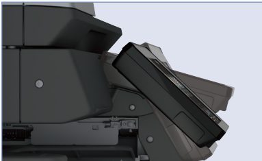
Pivoting Touchscreen offers the viewing angle for any use instantly.