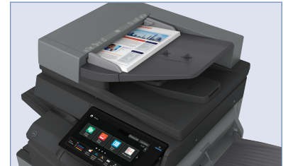
100-sheet RSPF scans documents at up-to 80 images per minute.